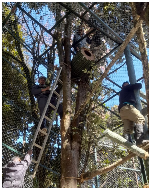
Placing of logs and ropes