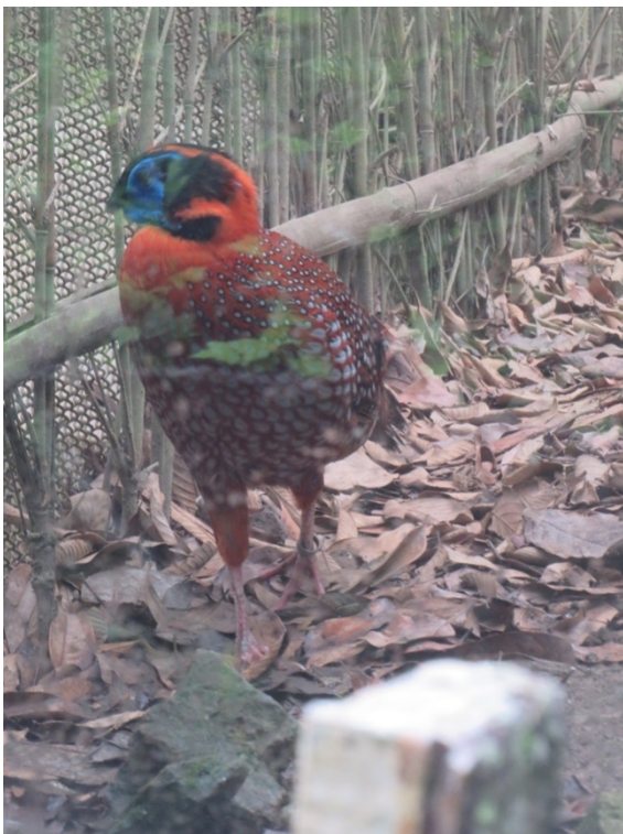
Dry leaf sheets for pheasants