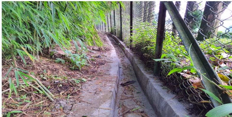
Construction and Repair of drains