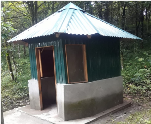
Guardhouse at Topkeydara