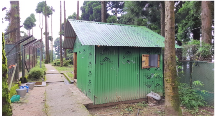
Guardhouse at Dowhill