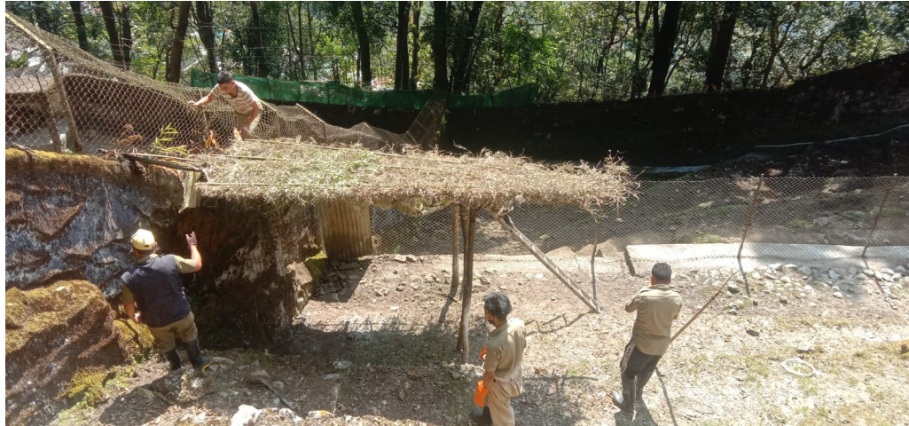
Repairing of rain shelters at herbivore enclosure